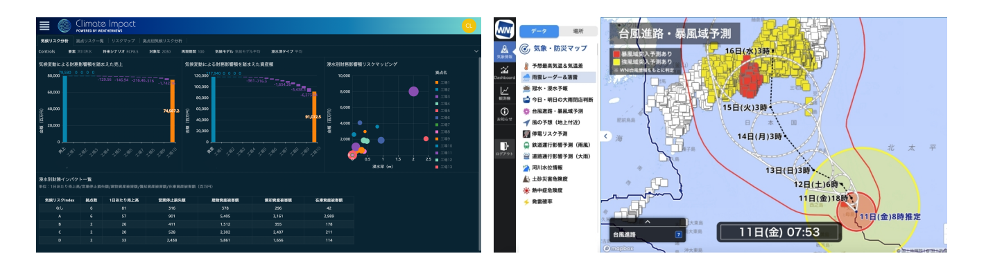
Climate Change Risk Analysis Services