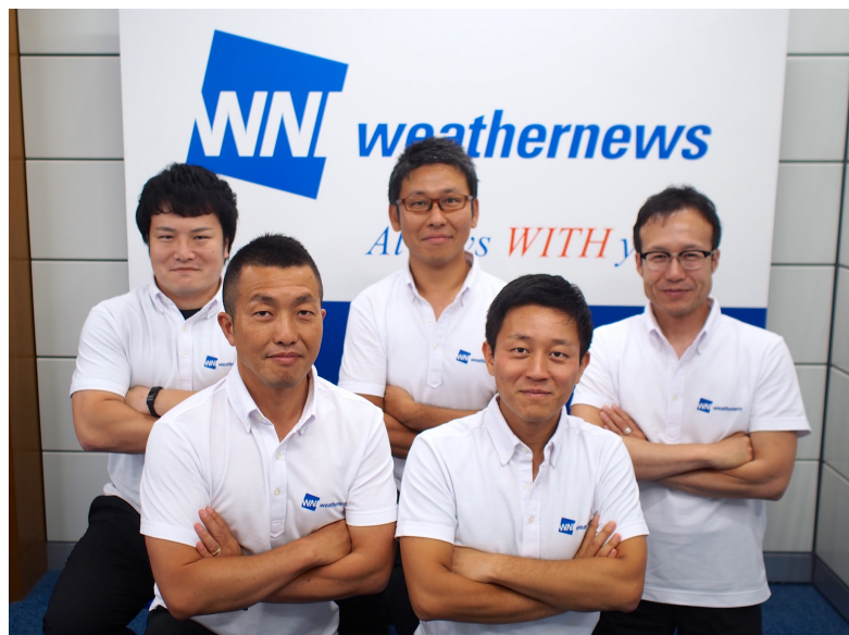
Weathernews Five Expert Staff of the Sports Weather Team

Five risk communicators from the Sports Weather Team will remain onsite in Rio from August 3 rd until August 21 st coordinating with GC to support Japan's National triathlon, sailing, rugby and women's field hockey teams. Using their professional experience and proprietary sensing equipment to gauge conditions in the areas around the sporting venues, the Sports Weather team will then share synoptic observations with their colleagues at GC. The local data from Rio will be incorporated into highly accurate forecasting content tailored for Japan's national teams.